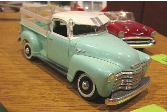
1/25 AMT/ERTL 1950 Chevy Pickup by Jim Burton