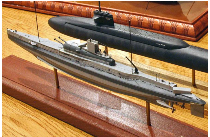
1/350 Combat Sub - Surcouf French Submarine by John Thirion