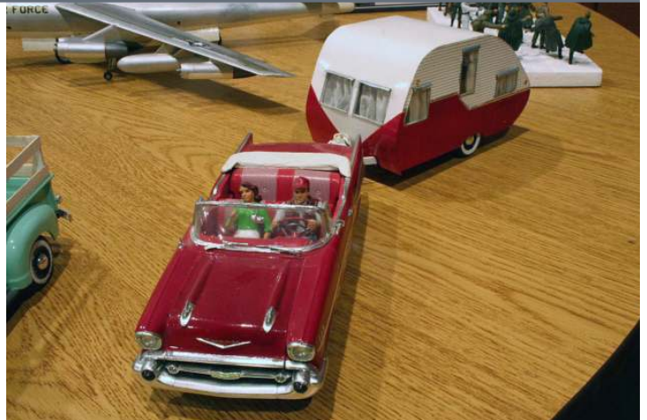
1/25 1957 Chevy with Travel Trailer by Jim Burton