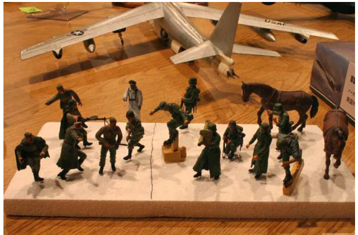
1/35 Figures in progress by John Cromarty