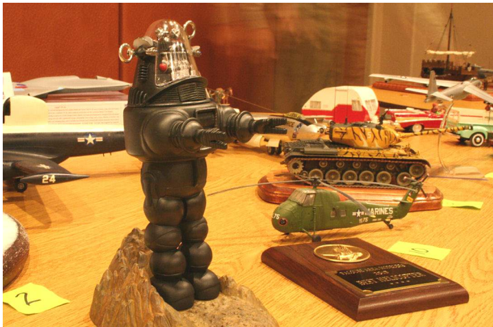
3 rd Place 1/8 Polar Lights Robby the Robot by Randy Hall