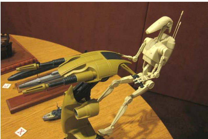
Star Wars Battle Droid by Jim Burton