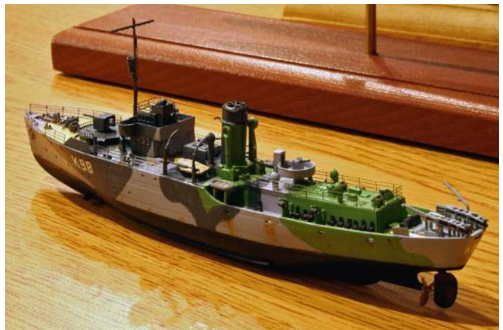
1/350 Mirage Models Flower Class Corvette by Dan Shepard