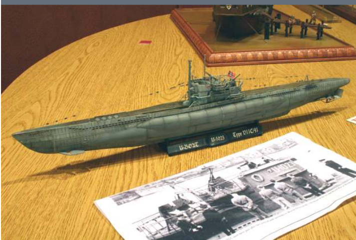
1/144 Revell U-Boat Type VII C 41-U1023 by Jeff D'Andrea