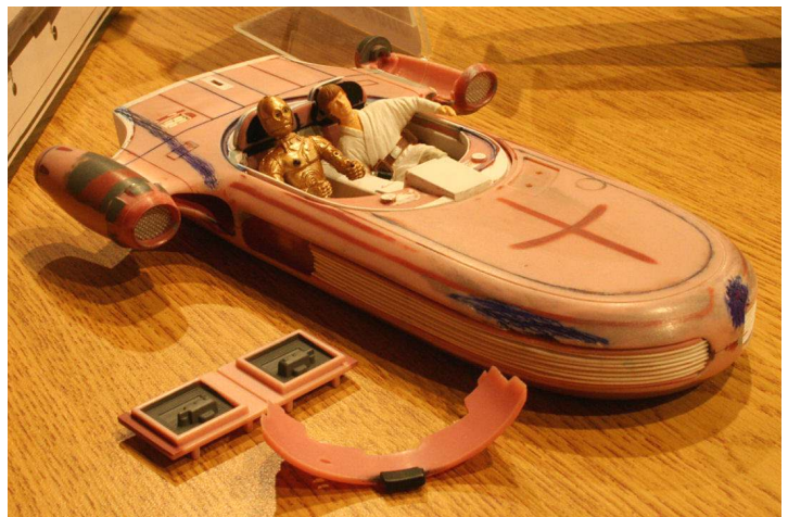
1/14 Revell Luke Skywalker's Landspeeder in progress by Bill Speece