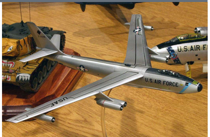
2 nd Place 1/144 Hobbycraft Boeing RB-47H by Herb Arnold