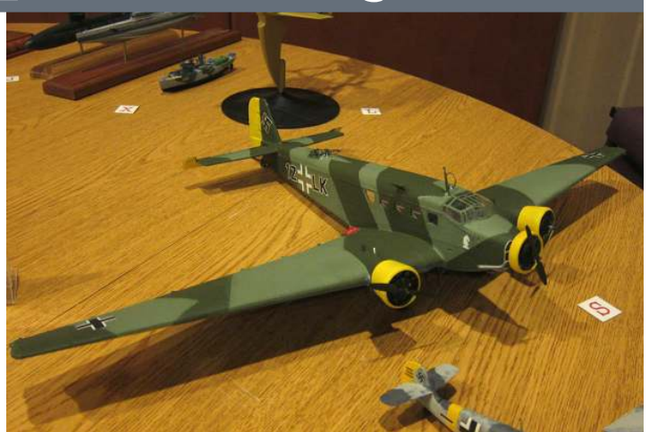
1/48 ProModeler Ju 52 Transport by Jim Burton