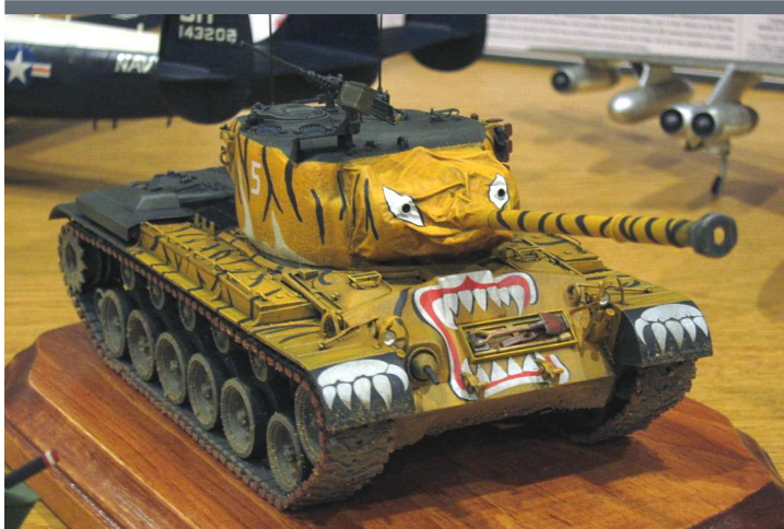
1 st Place 1/32 Dragon M-46 Patton Tank By George Bacon