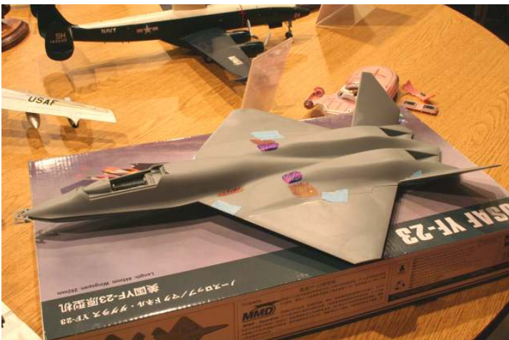
1/48 HobbyBoss YF-23 in progress by Bill Speece