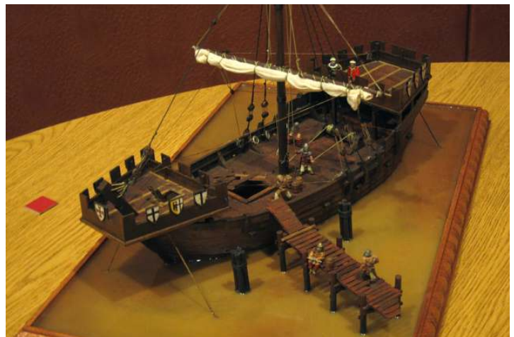
Zvezda Hansa Cog