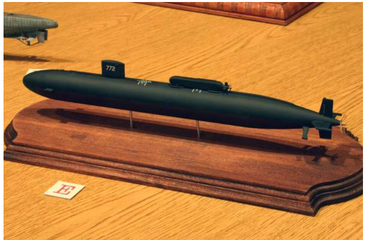
1/350 HobbyBoss USS Greenville 688i Sub by Randy Hall