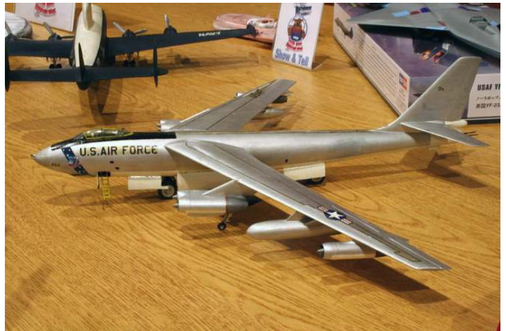
1/72 Hasegawa B-47E by Terry Falk