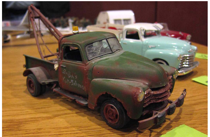
1/25 scratch-built 1950 Chevy Wrecker by Jim Burton