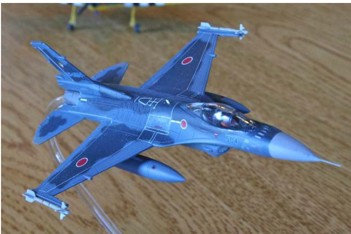
1/72 Platz Mitsubishi F-2A by Herb Arnold