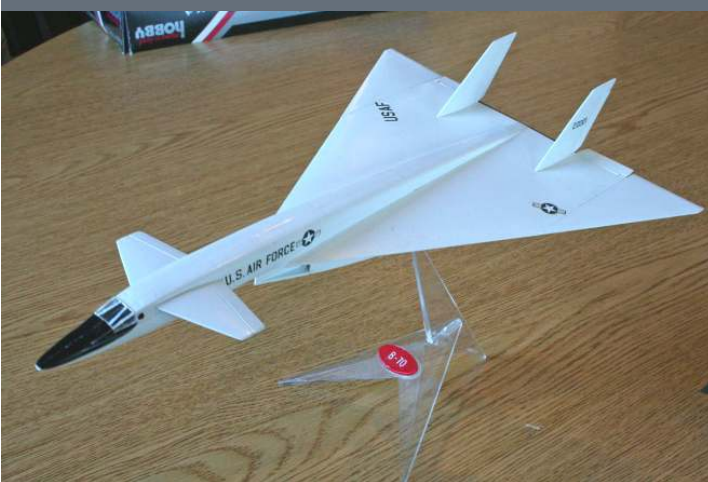
1/160 Lindberg B-70 Valkyrie by Terry Falk