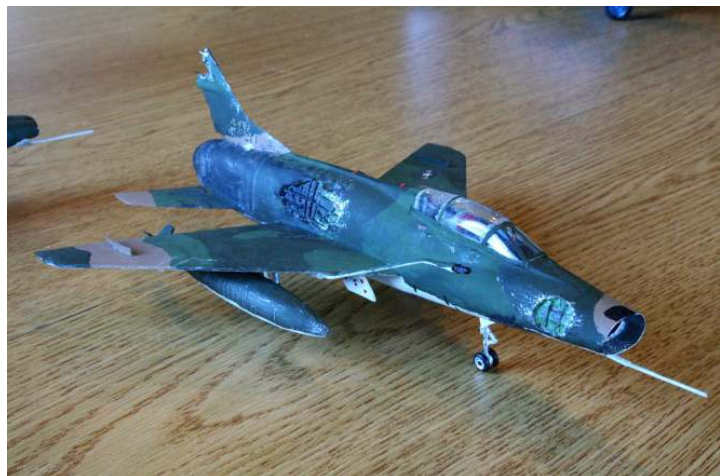
1/72 IMC F100F "Battle Damaged" by Terry Falk