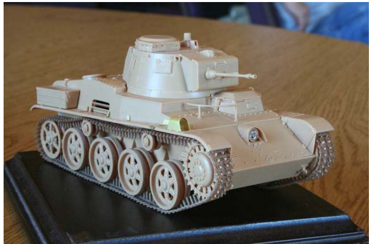
1/35 Hobby Boss 38M Toldi I in progress by Brian Geiger