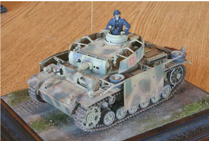
1/35 Panzer III M by Brian Geiger