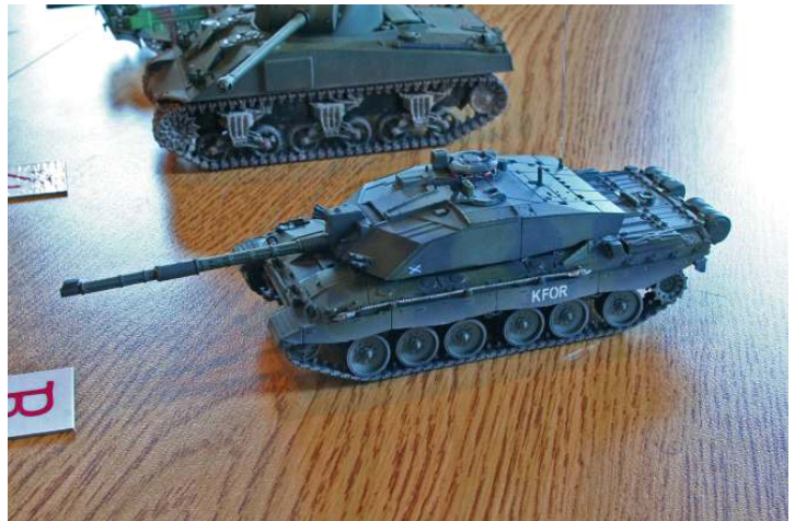
1/72 Dragon Challenger 2 by Tom Gloeckle