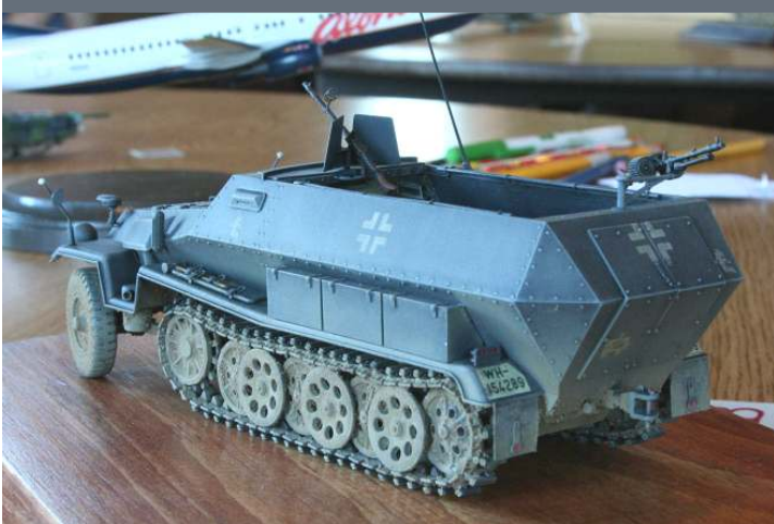
1/35 Tamiya Sd.Kfz. 251 Ausf. C by George Bacon