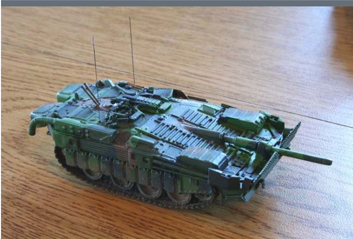
1/72 Trumpeter Strv 103C by Tom Gloeckle