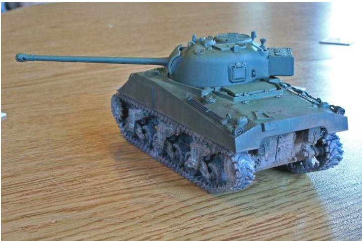
1/48 Sherman Firefly By Tom Gloeckle