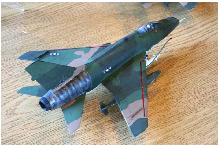
1/72 Hasegawa F-100D by Terry Falk