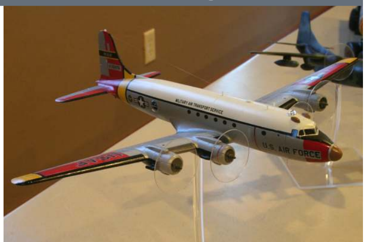
1/144 Minicraft SC-54B by Herb Arnold