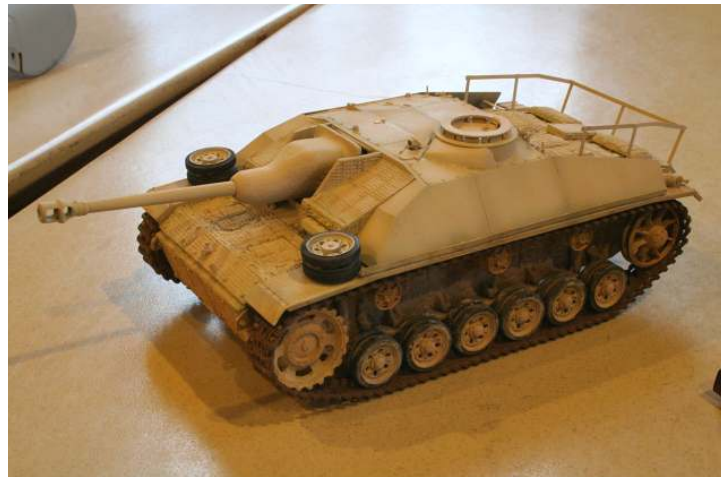
1/35 Tamiya StuG III G hybrid in progress by Brian Geiger