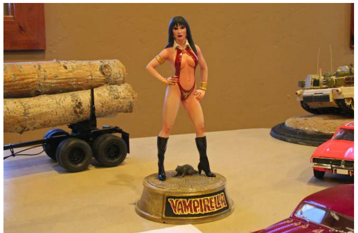
1/12 Solarwind Vampirella by Randy Hall