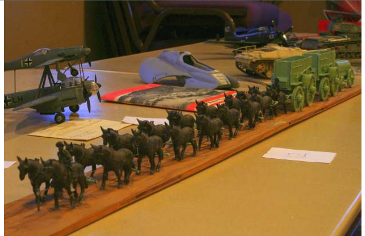
18 Mule Train in progress by Terry Falk