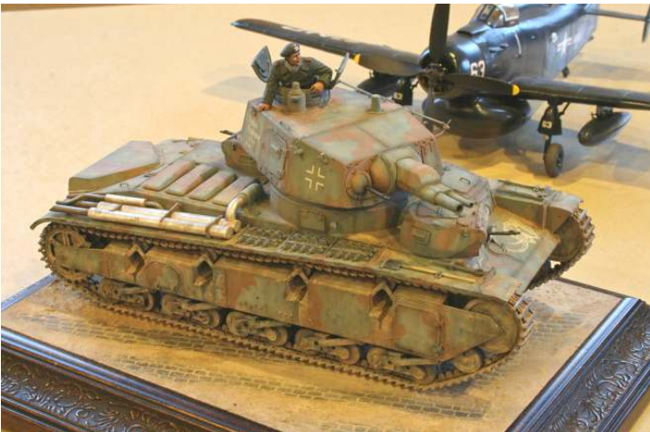
1/35 Dragon Neubau-fahrzeug by Brian Geiger