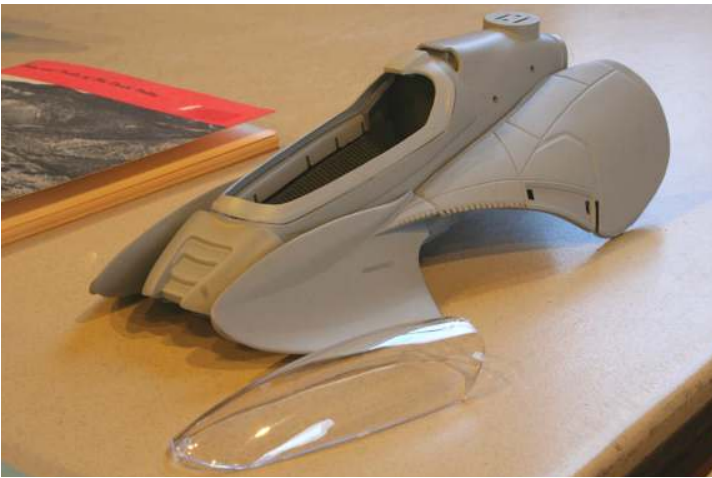
Star Trek The Next Generation craft in progress by Paul Erlendson