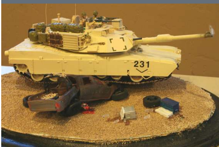
"Don't mess with a Tanker" 1/35 Academy M1 Abrams & Meng Toyota by Jim Burton