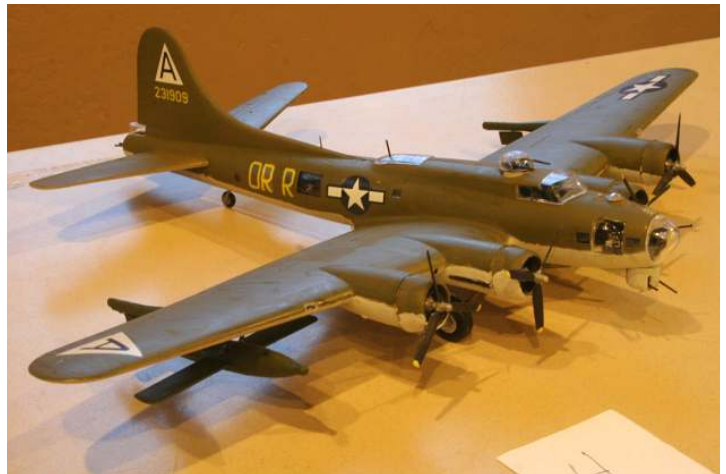
1/72 Minicraft B-17 by Bob Olson