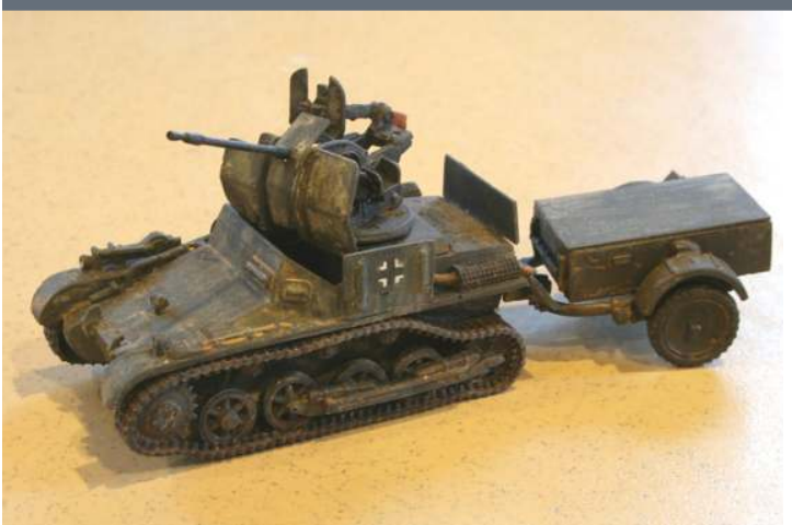
1/76 Resicast Flakpanzer I by Brian Geiger