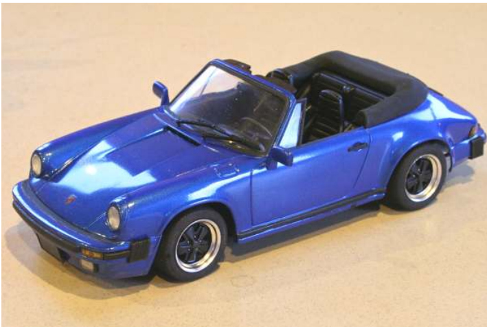
Fujimi 1/24 '85 Porsche 911 Cabriolet by Brian Geiger