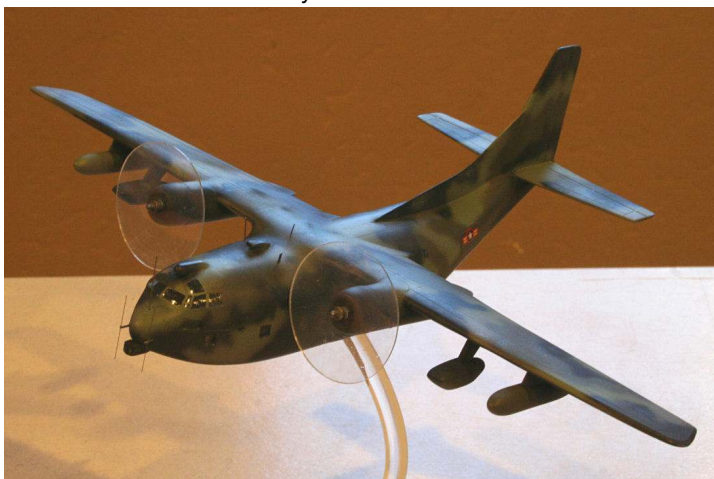
1/144 A model C-123K by Herb Arnold