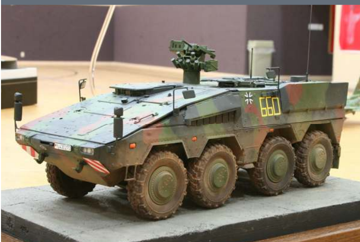
1/35 Revell Germany GTK Boxer by Tom Gloeckle