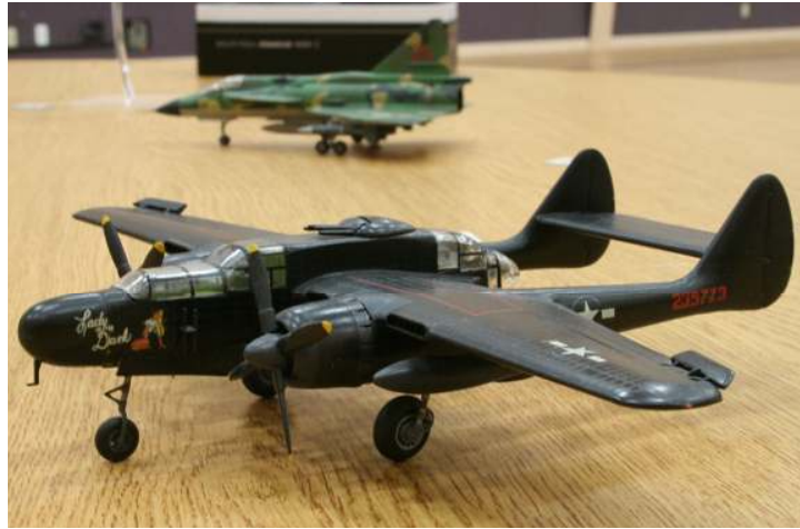
1/72 Airfix Northrop P-61 Black Widow by Don Vandervoort