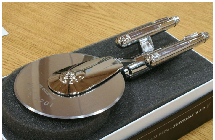
Star Trek Enterprise Pizza Cutter Thinkgeek.com - Larry Van Bussum