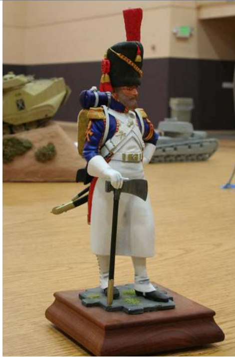
Imperial Guard Sapper 120mm Verlinden Figures by John Thirion