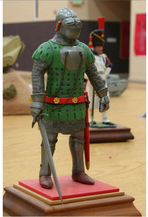
German Swabian Knight