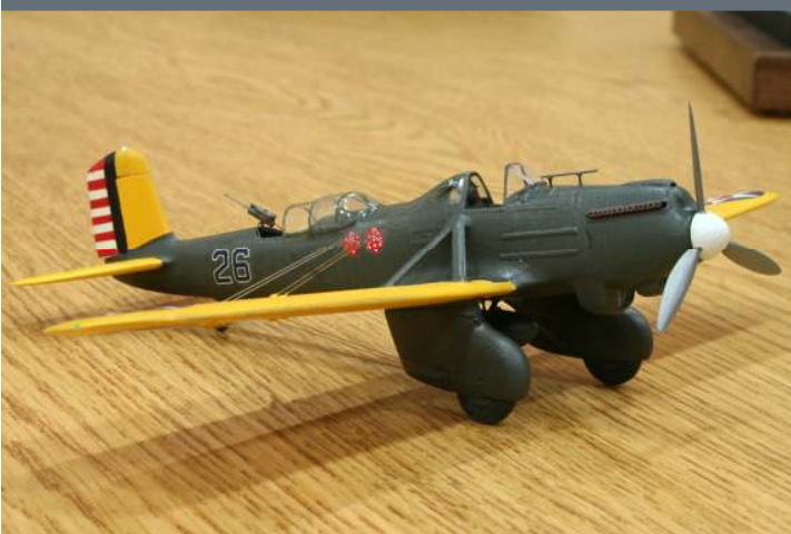
1/72 Rareplanes Curtiss A-8 by Herb Arnold