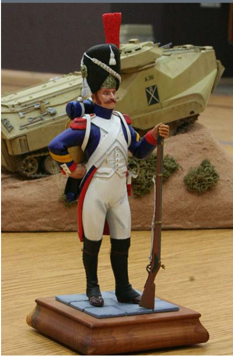
Imperial Guard Grenadier