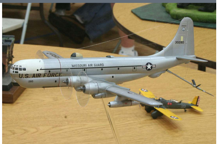
1/144 Minicraft KC-97L by Herb Arnold