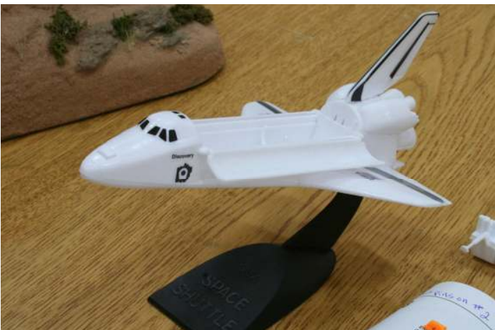
1/200 scale Revell Make 'N Take Space Shuttle by John Cromarty