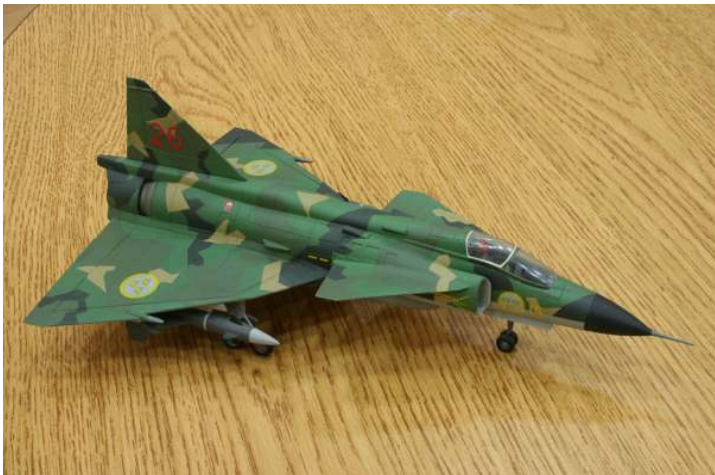
1/72 Matchbox Saab 37 Viggen by Don Vandervoort