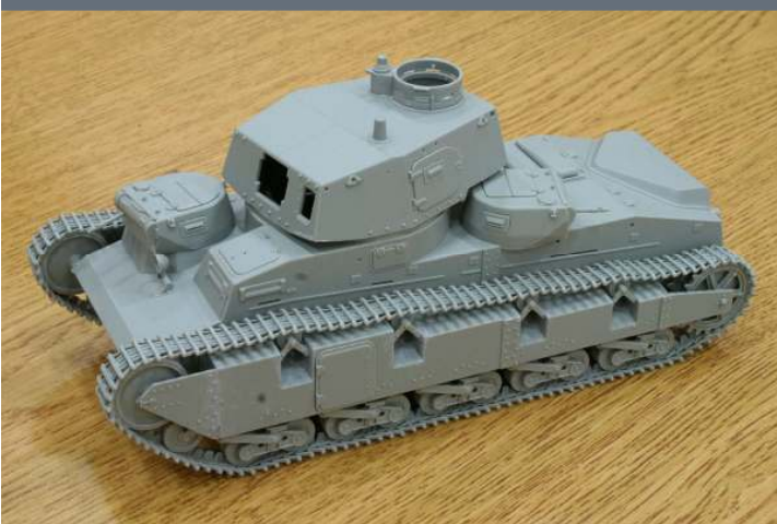
1/35 Dragon Neubau-Fahrzeug by Brian Geiger