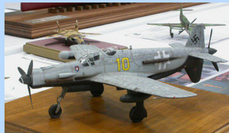
1. Glenn Beck